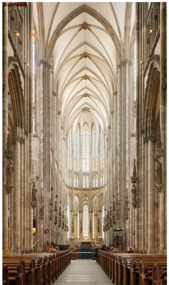
Cologne Cathedral, Interior, main nave, east-facing view