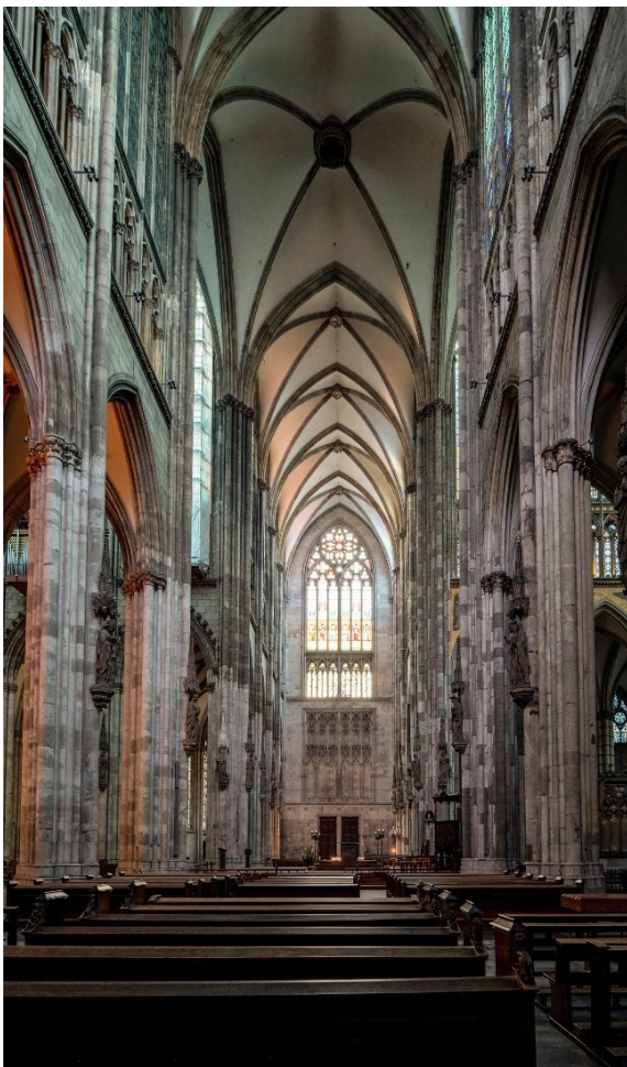
Cologne Cathedral, Interior, transept, north-facing view