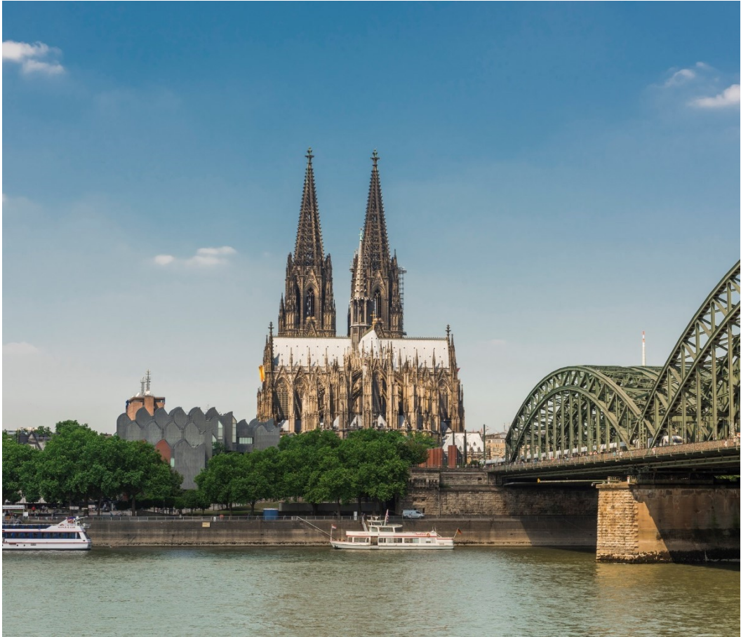
Exterior seen from Deutz with the Hohenzollern Bridge in view